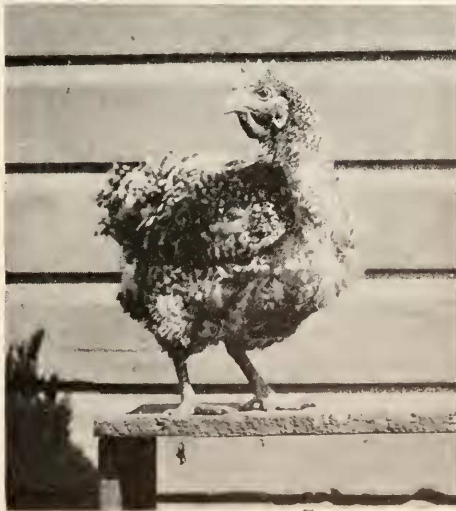
FIG. 1. Hen 4101 showing molt induced by single heavy dose of thyroid: fed 20-22 gms. thyroid Jan. 24, 1926; photographed Apr. 5, 1926.

Among the eight hens which survived thyroid administration seven showed a loosening of the feathers, which pulled out quite easily from 4 to 9 days later. A rather precipitous molt followed in these 7 hens in from 7 to 10 days (see figure 1). Careful